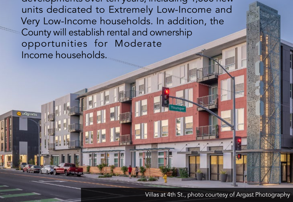
Villas at 4th St., photo courtesy of Argast Photography

In November of 2016, Santa Clara County voters approved a $950 million Affordable Housing Bond. It is projected that the Housing Bond will fund 120 new affordable housing developments over ten years, including 4,800 new units dedicated to Extremely Low-Income and Very Low-Income households. In addition, the County will establish rental and ownership opportunities for Moderate Income households.