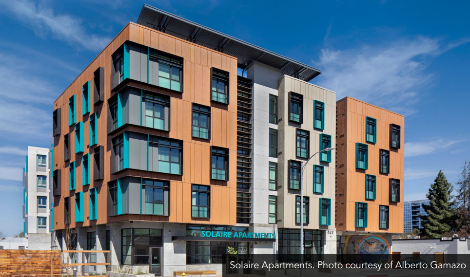
Solaire Apartments.

In November of 2016, Santa Clara County voters approved a $950 million Affordable Housing Bond. It is projected that the Housing Bond will fund 120 new affordable housing developments over ten years, including 4,800 new units dedicated to Extremely Low-Income and Very Low-Income households. In addition, the County will establish rental and ownership opportunities for Moderate Income households.